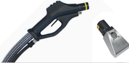
STAR steam/vac hose 8m + upholstery nozzle