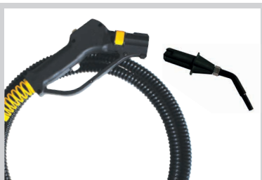
JULY steam hose 8m + bayonette lance