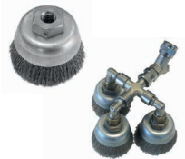
Stainless steel brushes T50