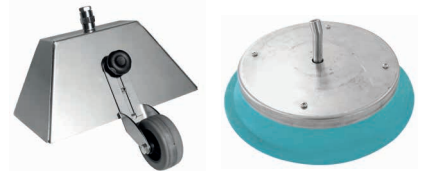
Weed killing conveyor