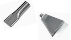
Flat nozzle 1cm