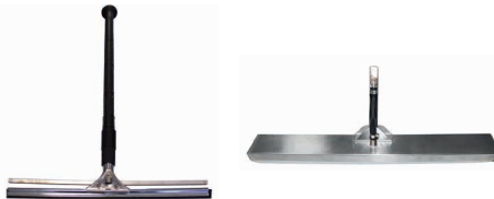
Window cleaner w/diffuser - Steam brush w/bristles